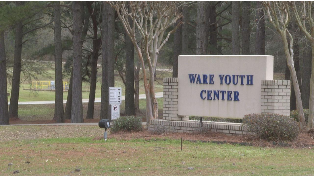
Ware Youth Center